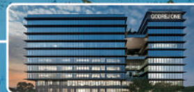
GODREJ PET CARE HEAD OFFICE, MUMBAI