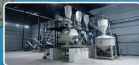
GODREJ ANIMAL PROTEIN RENDERING FACILITY, NAVI MUMBAI