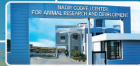
NADIR GODREJ CENTRE FOR RESEARCH & DEVELOPMENT, NASHIK