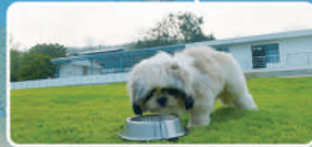
IN-HOUSE KENNEL, NASHIK