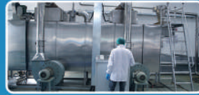
PROTOTYPING PLANT, NASHIK