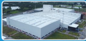
PET FOOD MEGAPLANT, NASHIK

Strategically located facilities supporting innovation, quality, and scale.